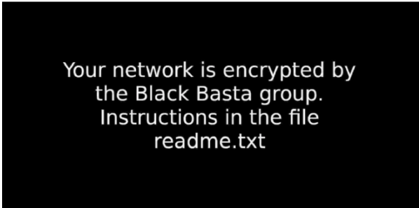
Figure 1: Sample Black Basta Ransomware Note. (Trend Micro Incorporated - Ransomware Spotlight: Black Basta)

Having already attacked several health and public health sector organizations in 2022, Black Basta is a credible threat to the sector. In its first year alone, the group exclusively targeted U.S.-based organizations, seeking to purchase network access credentials for companies specifically located there. In these attacks, Black Basta not only affected the websites of specific health information technology, healthcare industry services, laboratory and pharmaceutical, and health plans organizations across multiple states, but also cumulatively stole several gigabytes of data on personal identifiable information (PII) for members of health organizations, their customers, and employees. Continued and future attacks on and unpatched critical vulnerabilities in the public health and healthcare systems sector could be potentially life threatening, the impact of which would be devastating to critical infrastructure.