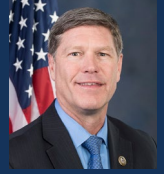
Congressman Ron Kind, WI Co-Chair Rural Health Care Coalition