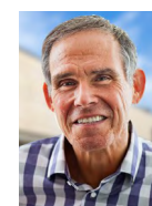
Eric Topol, M.D. Executive vice president Scripps Research Founder and director Scripps Research Translational Institute La Jolla, Calif.