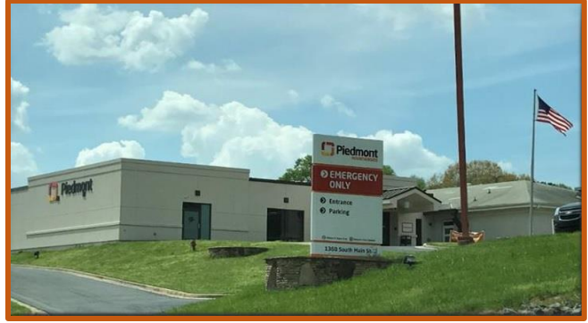
Piedmont Mountainside Hospital Emergency Services

It was January 2016, when Atlanta-based SunLink Health informed the community of its intention to close North Georgia Medical Center (NGMC), in Ellijay, GA. The Gilmer County Board of Commissioners expressed skepticism and sought assurance that the medical facility would remain. Openly they believed that the best the county residents could hope for was to have the emergency department (ED) open for one year.