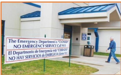
North Georgia Medical Center

The change did not affect Gilmer Nursing Home or the physicians based at the Medical Offices of North Georgia. Most of the hospital services remained the same, including outpatient and inpatient care, surgery, swing bed rehabilitation and nursing home care. Departments such as laboratory, radiology, and respiratory continued to operate and see patients with only a change in the hours that those services were available.