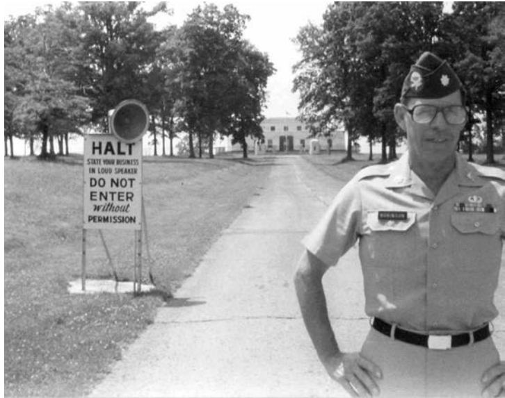
At Fort Knox