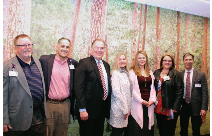
Billings Clinic leadership involved in the opening of the Psychiatric Stabilization Unit stand in front of the tranquil wall art selected for the unit.

When a person arrives at the ED with a mental health issue, the first step is to clear the patient medically – that is, ensure that there isn't co-morbid substance intoxication or a medical problem, such as a brain injury or a systemic infection, that is exacerbating the crisis. Once cleared, the patient needs to be seen by a psychiatric caregiver. Historically, that patient would wait in the ED for the psych consult. That wait could be long, depending on what other responsibilities the psychiatrists, social workers, and others on the behavioral health team have that day. During that time, the patient is occupying an ED bed