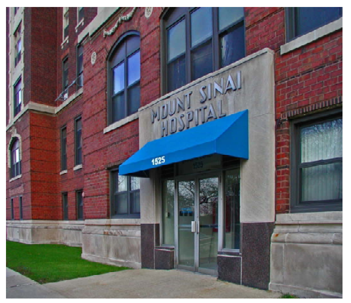
Mount Sinai Hospital (Chicago, IL)

After a lot of thought, I decided to go there. I figured, this would give me an opportunity to do something other than human resources and would give me an opportunity to learn more about