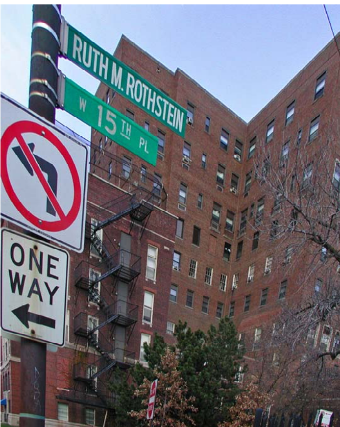
The City of Chicago named West 15<sup>th</sup> Place after Ruth M. Rothstein. Mount Sinai Hospital is in the background.

it happened when we rebuilt the kitchen and we put in a new cafeteria and a new board room, and we built a kind of a porch off the cafeteria for special functions. It was very