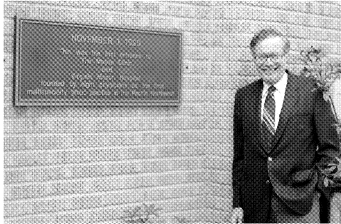
The Founder's Plaque reads: "November 1, 1920. This was the first entrance to The Mason Clinic and Virginia Mason Hospital founded by eight physicians as the first multispecialty group practice in the Pacific Northwest."