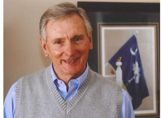
Photo taken in 2006 at the induction into the Modern Healthcare Hall of Fame