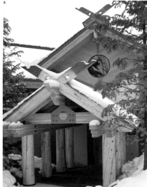
Site of the Jackson Hole Group meetings