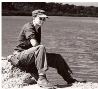
Serving in the Philippines, 1946