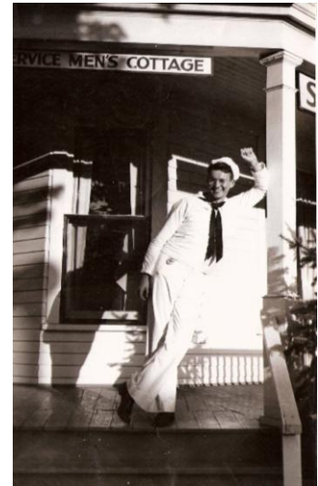
Great Lakes Naval Station, Waukegan, IL in 1945

During the war in the Pacific, the harbor was filled with great aircraft carriers and Henry Kaiser's Liberty Ships. I heard about Mr. Kaiser and Dr. Sidney Garfield starting a health plan for the shipyard workers because the local doctors, like my father, had gone to war. 1 When I met Dr. Garfield in person at a dinner decades later, he confided, "I wish you would