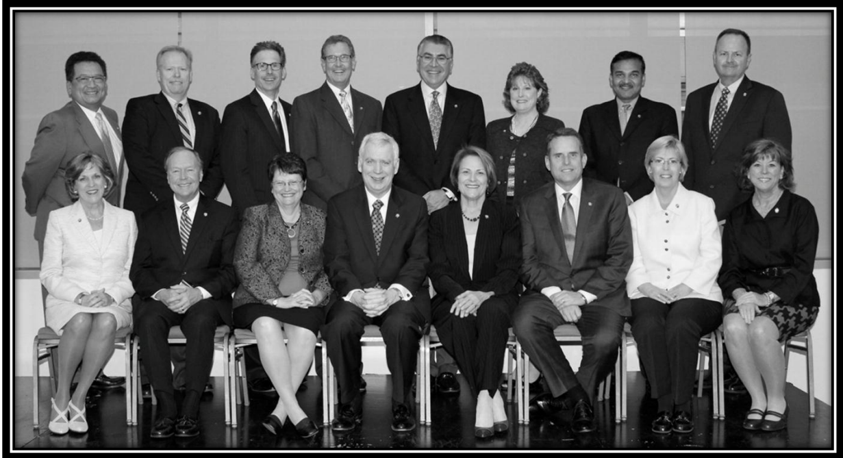
The 2012 ACHE Board of Governors