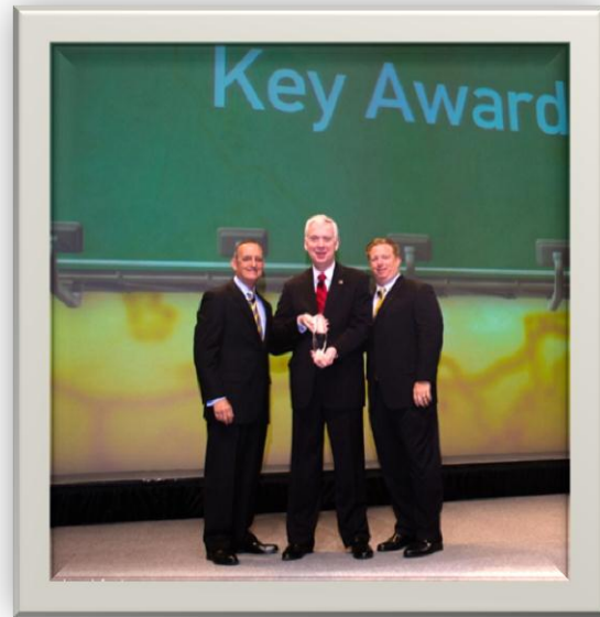
Receiving the Key Award from the American Society of Association Executives

Workplace Partnership for Life Association Leadership Award, U.S. Department of Health and Human Services