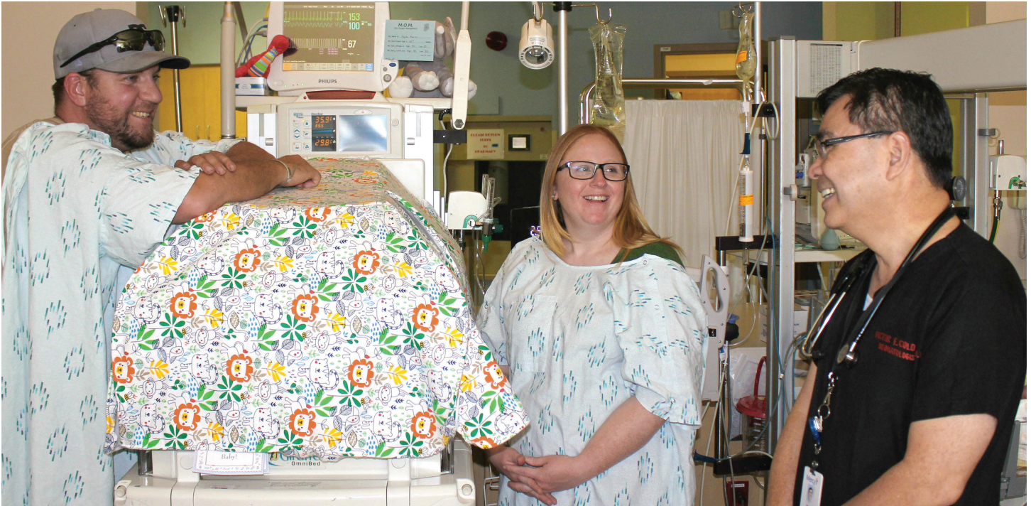
New parents chat with a physician in Mercy Health Fort Smith's NICU.