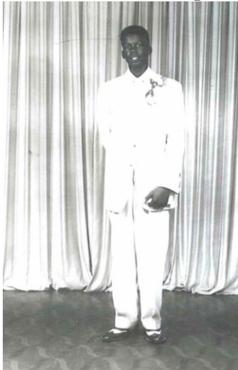
Eighth grade graduation