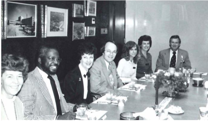
A meeting at Parkview Hospital, Fort Wayne, Indiana